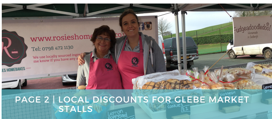
PAGE 2 | LOCAL DISCOUNTS FOR GLEBE MARKET STALLS