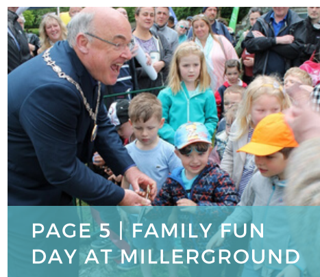
PAGE 5 | FAMILY FUN DAY AT MILLERGROUND