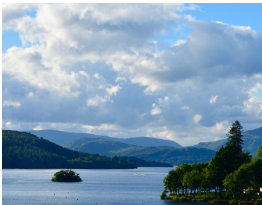
PAGE 3 | NEXT BWF MEETING AND PROJECTS