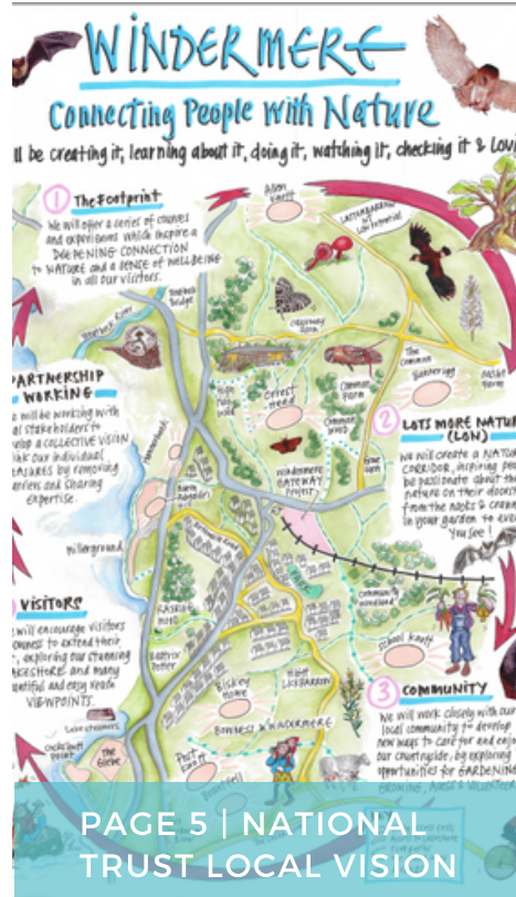
PAGE 5 | NATIONAL TRUST LOCAL VISION